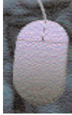
Should you be afraid of a mouse ?

Long periods of uninterrupted use of VDU's may predispose some users to aches and pains in their hands, wrists, arms, neck, shoulders and back.